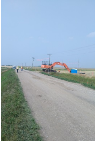
Access to ROW at road 59 Black Creek